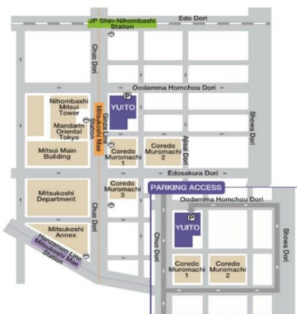
Tokyo Metro Ginza and Hanzomon Lines-Mitsukoshimae Station Exit A9 (Direct connection)-1 minute walk JR Shinnihonbashi Station Exit 2-3 minutes walk

1992 M.D. National Board of Medical Examination, Ministry of Health and Welfare, Japan, 1998 Ph.D. Keio University, Japan, 1999-2001 Visiting Scholar, Department of Engineering, Stanford University, Stanford, CA 2002 – 2004 Research Associate (Non-tenured), Department of Orthopedic Surgery, Keio University, School of Medicine, Tokyo, Japan 2004– 2009 Assistant Professor (Non-tenured), Department of Orthopedic Surgery, Keio University, School of Medicine, Tokyo, Japan 2010– Associate Professor (Non-tenured), Department of Clinical Biomechanics, Keio University, School of Medicine, Tokyo, Japan 2019- Professor (Non-tenured), Department of Clinical Biomechanics, Keio University, School of Medicine, Tokyo, Japan